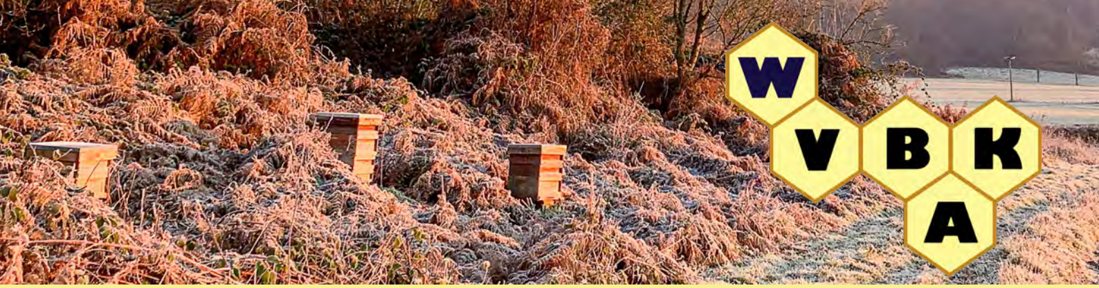
Photograph: Winter hives by Bee Dale...